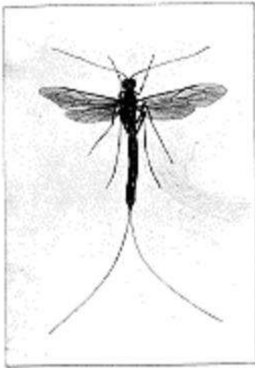
Rhysa persuasoria , AN INSECT PARASITIC ON LARVAE LIVING IN THE WOOD OF PINE TREES. ESTON HILLS.

Rhysa persuasoria , AN INSECT PARASITIC ON LARVAE LIVING IN THE WOOD OF PINE TREES. ESTON HILLS .