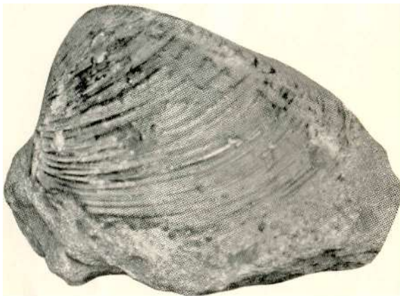
Trigonía lingonensis . MAIN SEAM OF IRONSTONE. MIDDLE LIAS. ESTON MINES.